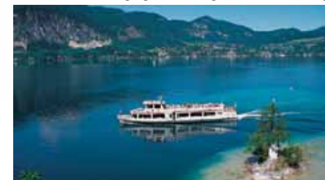
View across the Wolfgangsee to St. Gilgen, "The Mozart Village"

Let us begin in the city of Salzburg, where we can visit the houses where Mozart was born and lived. The bike trail runs past the pilgrimage church of Maria Plain, for which Mozart composed his Mass in F Major. As we make our way along the old Ischl rail line to Eugendorf, a detour to St. Gilgen is highly recommended. This town will always be associated with Mozart's mother, who was born here, as well as with his sister, Nannerl.