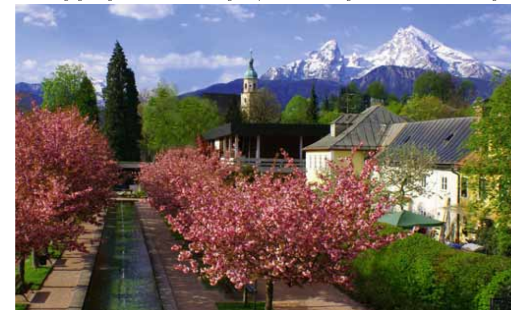
One highlight along the Mozart Bike Path: Berchtesgaden – pictured here is the "Kurgarten", with the Watzmann in the background