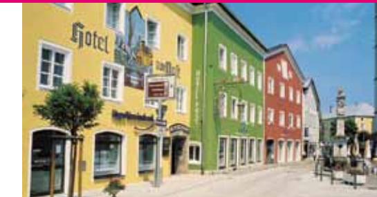
Market Square, Waging am See

So it is that our intrepid cyclists are exposed to a well-balanced blend of delightful landscapes, outdoor exercise and way stations in Mozart's life. Three connecting trails, which tie in such other "Mozart landmarks" as Inzell, Freilassing and Triebenbach Castle (south of Laufen), make it possible to take several different routes on our tour along the "Mozart Bike Trail" – resulting in an experience that is perfectly suited to our own personal tastes!