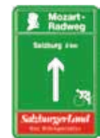
Example of the SalzburgerLand sign

As it makes its way through Austria and Bavaria, the Mozart Bike Trail is uniformly signposted in both directions with the same symbol (Mozart's head). The connecting trail between Laufen, Inzell and Kössen is also marked as the Mozart Bike Trail. The connecting trail from Bad Reichenhall to Salzburg follows the existing Tauern Cycle Path, while that from St. Lorenz to Köstendorf sticks to the Salzkammergut Bike Trail.