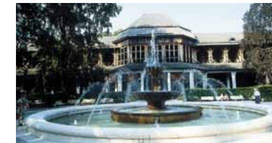
The "Gradierwerk" – one of three "Mozart landmarks" in Bad Reichenhall