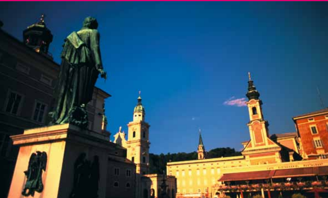
In Salzburg City: the Mozart monument on Mozart Square

Wolfgang Amadeus Mozart left his mark at numerous spots in and around Salzburg. A mosaic of "Mozart landmarks" is now interconnected by the Mozart Bike Trail. This cross-border bike trail runs through the heart of some of the most glorious lake country in all of Austria and Bavaria.