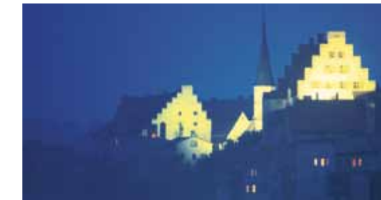
Wasserburg am Inn